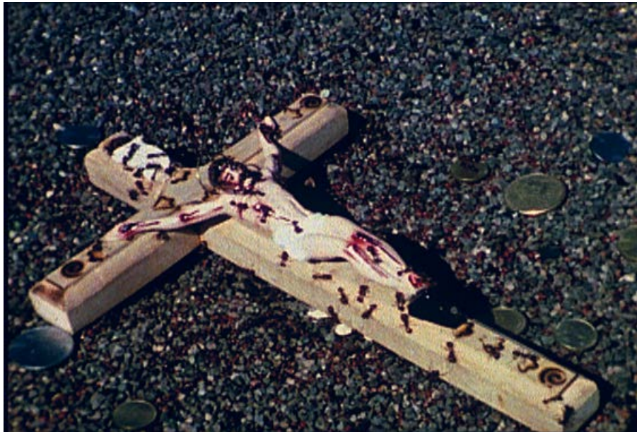
Fig. 3: David Wojnarowicz, Photo still from A Fire in My Belly , 1986–1987, super 8mm film transferred to video, 13:06 minutes and 7:00 minutes.

The main premise of Art AIDS America was that since the early 1980s, AIDS has been the great, albeit repressed influence shaping art, politics, medicine, and popular culture in the USA. With some 125 objects by around 100 artists (mostly white males),