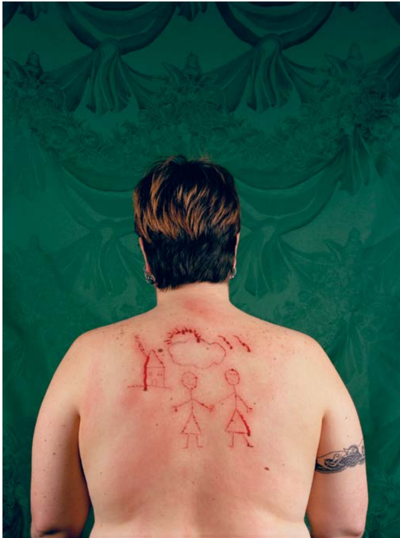
Fig. 2: Catherine Opie, Self-Portrait /Cutting , 1993, C-print, 40 x 30 inches (101.6 x 76.2 cm).

(1917). The “Modernism” section focused on the gay subcultures in cities such as New York, predominantly during World War I (1914–18), and included Marsden Hartley’s Painting No. 47, Berlin (1914–15), for example, and Charles Demuth’s Dancing Sailors (1917). The section “1930s and After” explored the many contributions gay and lesbian artists made to US Modernism of the 1930s, including Hartley’s Eight Bells Folly: Memorial for Hart Crane (1933) and Grant Wood’s painting Arnold Comes of Age (1930). The section “Consensus and Conflict” examined work produced in the fifties and early sixties, a time of social and cultural conflict, as well as one in which the US government was obsessed with “subversion” (also known as the “Lavender Scare”), prompting artists to suppress or code gay and lesbian content for fear of exposure: Robert Rauschenberg’s lithograph Canto XIV (1959–60) and Jasper Johns’ In Memory of My Feelings—Frank O’Hara (1961) were used as prime examples. The section “Stonewall and After” focused on work produced from the 1960s to the early 21st century, which grew out of the gay liberation movement sparked by the Stonewall Riots of 1969. Hujar’s portrait of Susan Sontag (1975) and Warhol’s Camouflage Self-Portrait (1986) were included in this section. In the “AIDS” section, viewers encountered works that dealt directly with the AIDS crisis in the USA (or the “gay plague,” as it was also called).