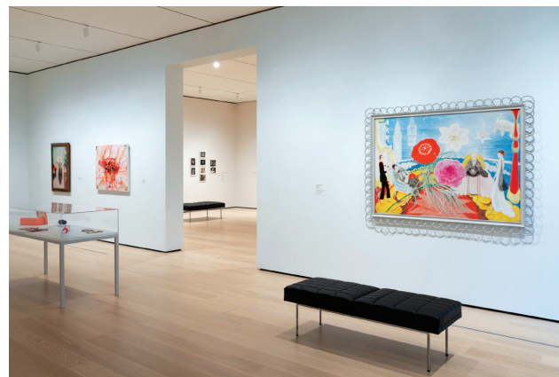
Installation view of a room dedicated to “Florine Stettheimer and Company.”