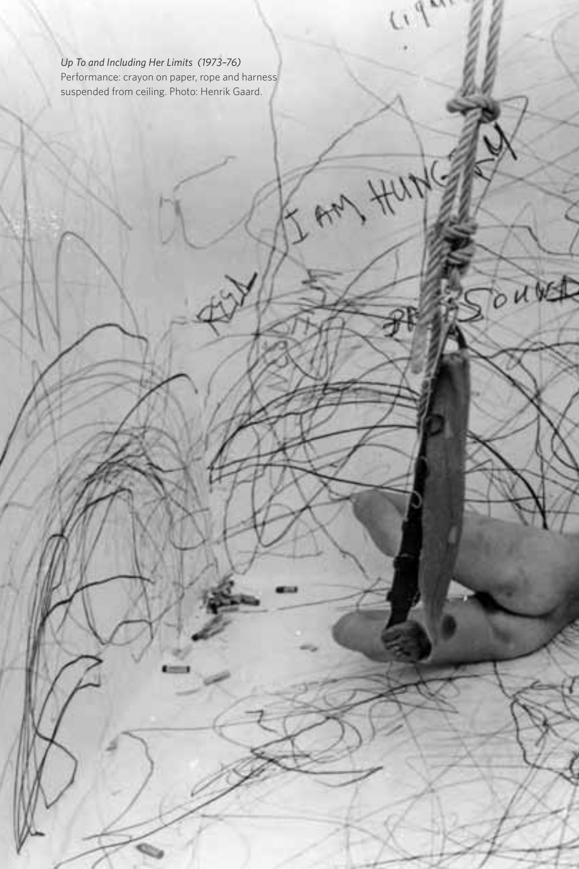
Up To and Including Her Limits (1973-76) Performance: crayon on paper, rope and harness suspended from ceiling.