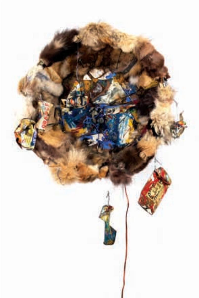
Fur Wheel (1962)

Motorized construction: lamp shade base, fur, tins cans, mirrors, glass, oil paint, mounted on turning wheel; 14 × 14 × 26 inches.