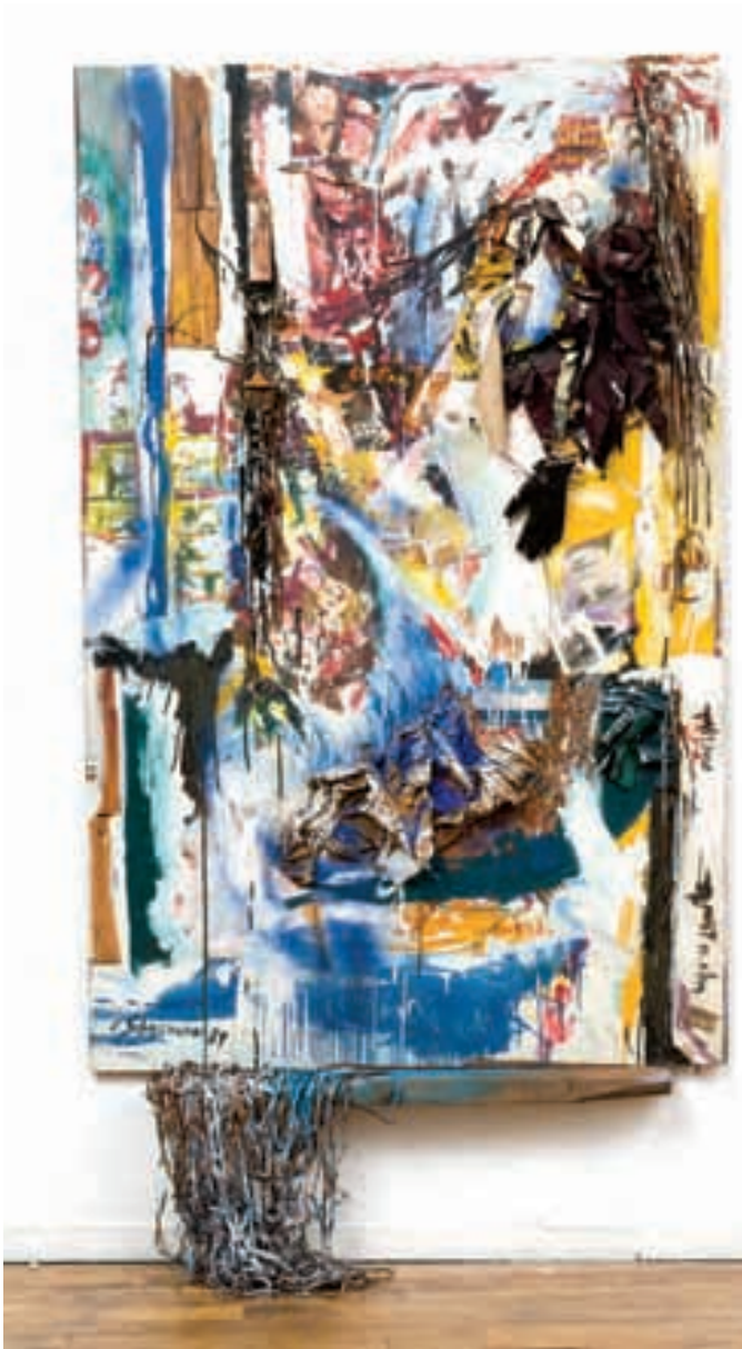
One Window Is Clear - Notes to Lou Andreas Salomé (1965) Painting construction: Masonite, photo reproductions of Salomé, Rilke, Nietzsche, cloth, recording tape, paper, gloves, canvas, oil paint; 77.5 × 48 × 3.5 inches.