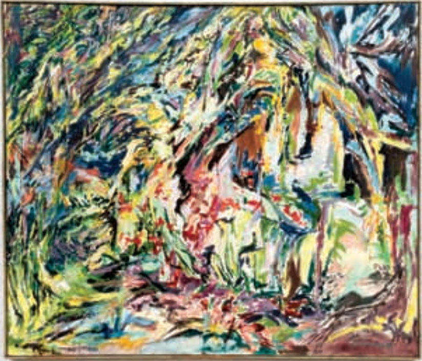
Summer I (Honey Suckle) (1959) Oil on canvas; 42 × 49 inches.