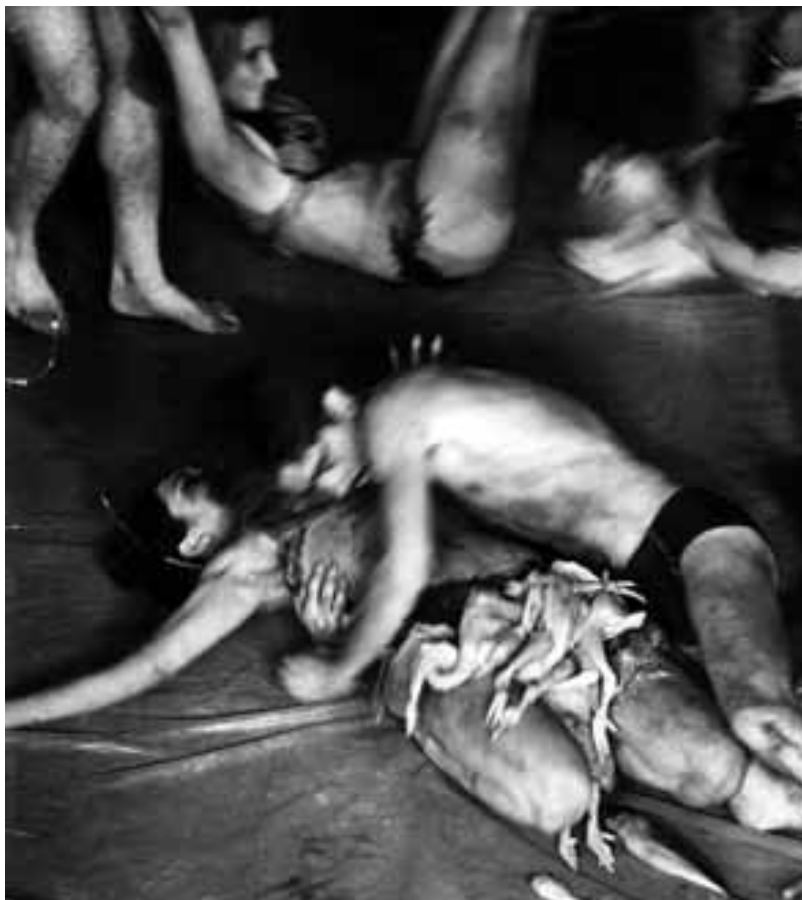
Meat Joy (1964) Performance: raw fish, chickens, sausages, wet paint, plastic, rope, paper scrap.

baked, and heavily collaged the surface of the film, producing a physically thick, textured film object not unlike the surfaces of the painting constructions she was making simultaneously. As the artist explains, “As a painter ... I wanted the bodies to be turning into tactile sensations of flickers.” For the viewer, the naked bodies move in and out of the frame, dissolving optically before their eyes, not a literal translation but “edited as a music of frames.” 5