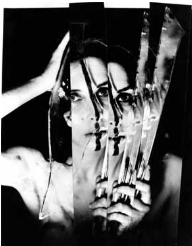
Eye Body: 36 Transformative Actions (1963) Action for camera.