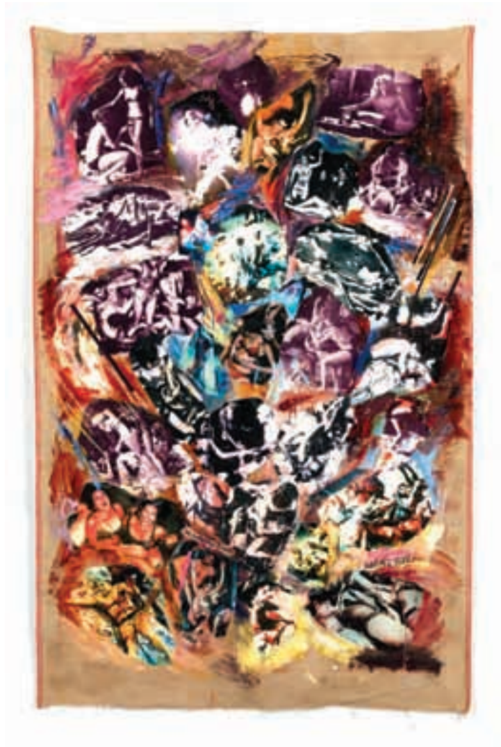
"Meat Joy" (1999; images 1964) Performance collage: photos from 1964 performance, crayon, paint on linen; 83 × 53 inches.